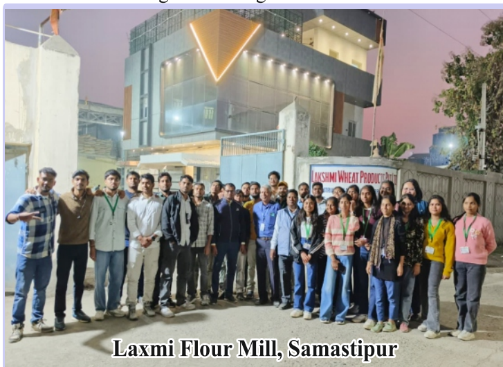
Laxmi Flour Mill, Samastipur

Field Visit Organized : The academic/practical field visit of all 36 students of the B.Tech. (Agricultural Engineering & Technology) fifth semester of the College of Agricultural Engineering and Technology, Pusa, was organized on 28 November 2025 by the Department of Processing and Food Engineering. The visit was conducted under the guidance of the Head of Department and faculty members to familiarize the students with real industrial processes related to food storage, processing, and quality control. The visit conducted at Adani Agri Logistics, Srirampur, Gopalpur, Pusa Road – Modern Silo Storage System; Laxmi Flour Mill, Samastipur – Production of Wheat-Based Products and FCI Warehouse, Samastipur – Conventional Storage and Fumigation