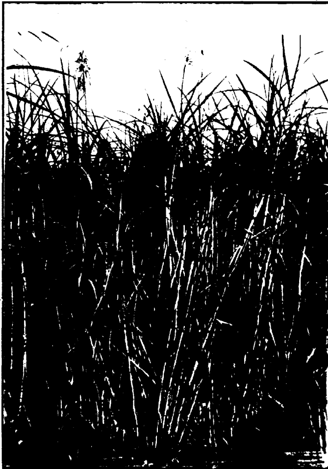
Co. 205 grown in a grower's field under swamp conditions. It yields in such conditions also about 50 per cent. more gur (raw sugar) than the local canes.