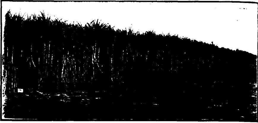
Co. 205 grown without irrigation at the Government Farm, Gurdaspur (Punjab). It yields about 50 per cent. more gur (raw sugar) than the local canes.