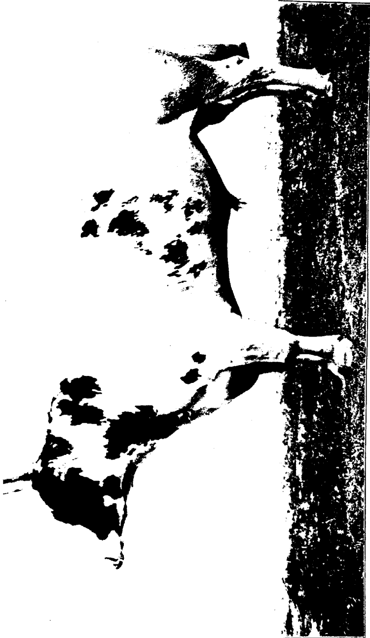
AYRSHIRE BULL "VICTORY BOND"