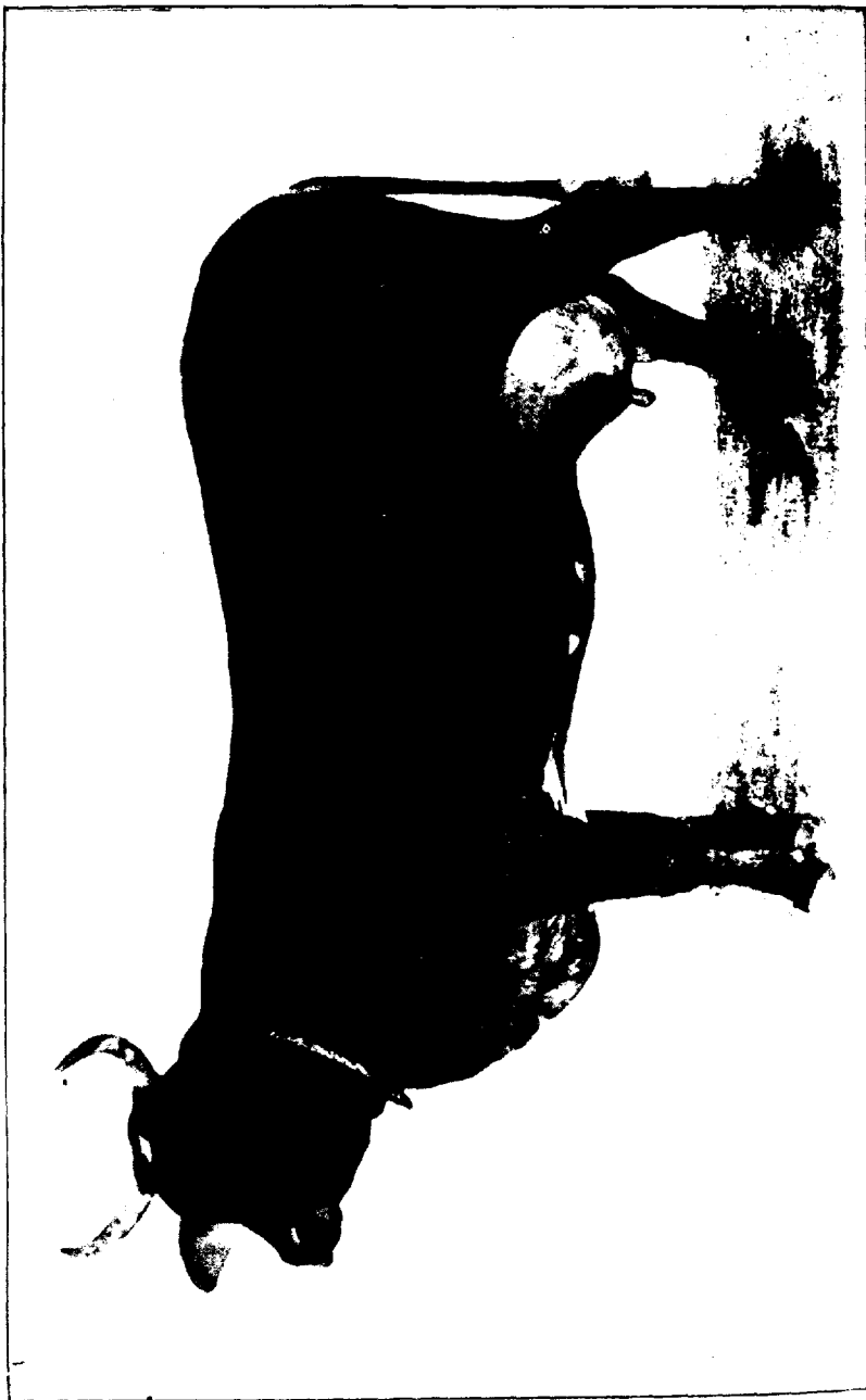
FIGURE 1. A NEW M. COW "MILK" HAS BEEN FEED 12,000 LBS. MILK IN 10 MONTHS.