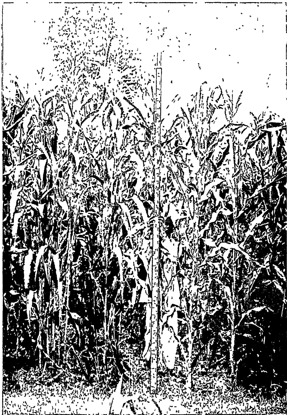
MAIZE AFTER BERSEEM IN DHAB LAND.