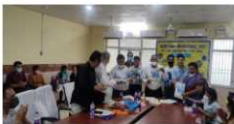
Release of Book, Practical Manual and Lab Manual