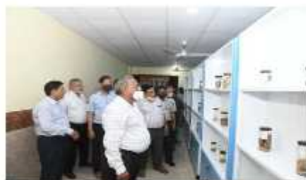
Inauguration of Fish Museum at COF, Dholi