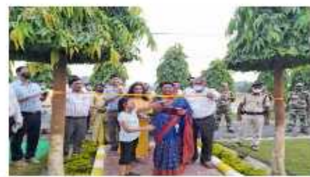
Inauguration of Matsya Vatika at COF, Dholi