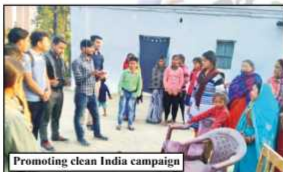
Promoting clean India campaign