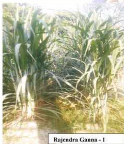
Rajendra Ganna - 1