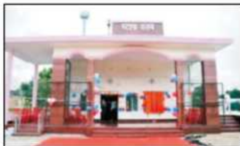
Children Park and staff club at RPCAU, Pusa Campus