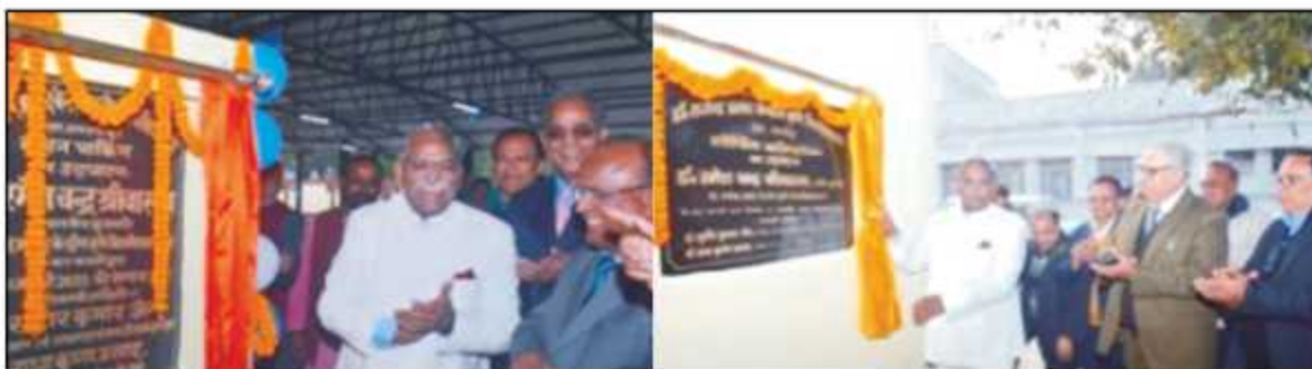
Inauguration of Parking shed and Shopping Complex