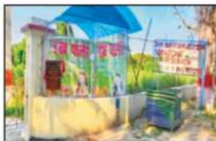
Inauguration of Sugarcane Juice Counter & Gur Processing centre at SRI