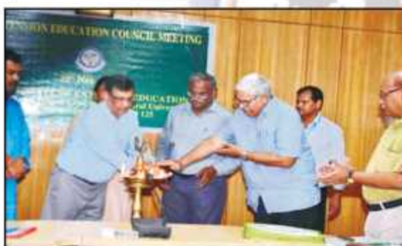
3rd Extension Education Council meeting of the RPCAU, Pusa held on 25th May 2019