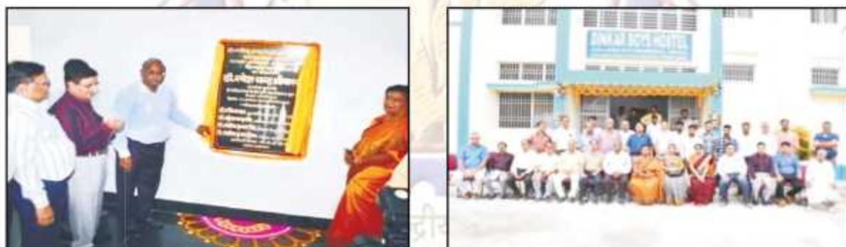
Inauguration of Dinkar Boys hostel at COF, Dholi