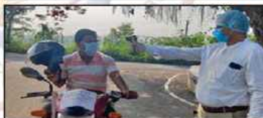
(Pedal based hand wash machine, boom spraying inside the campus, mask making & distribution and thermal scanning of visitors respectively)