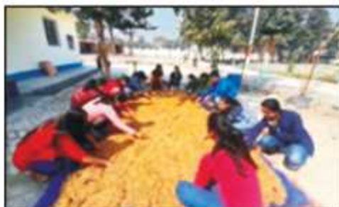
ELP on Mushroom, TCA, Dholi Centre