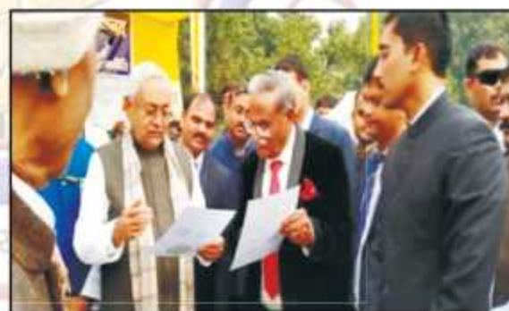
Field demonstration of vegetable planter, University roadmap for academic research & extension presented to Hon'ble CM Shri Nitish Kumar at Rajnagar Madhubani on Jal-Jivan-Hariyali fair.