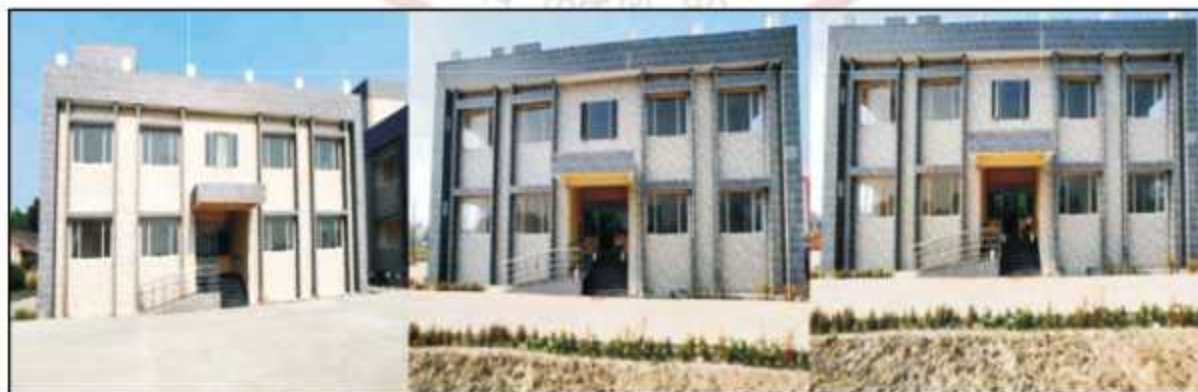
Three Research Buildings at RPCAU, Pusa campus