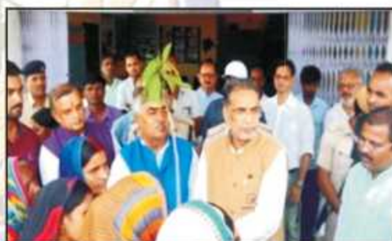
Celebration of Rakhi festival and plant distribution among farmers by Ex Union Ag. Minister of India and Hon'ble MP of East Champaran (Shri Radha Mohan Singh) at KVK Piprakothi