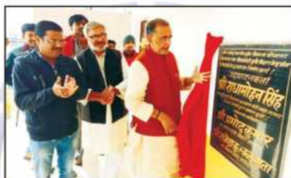
Inauguration of Exhibition Center and Seed Sale counter by MP, Motihari and Ex Agriculture Minister, GOI, at KVK Piprakothi. (15 Dec 2019).