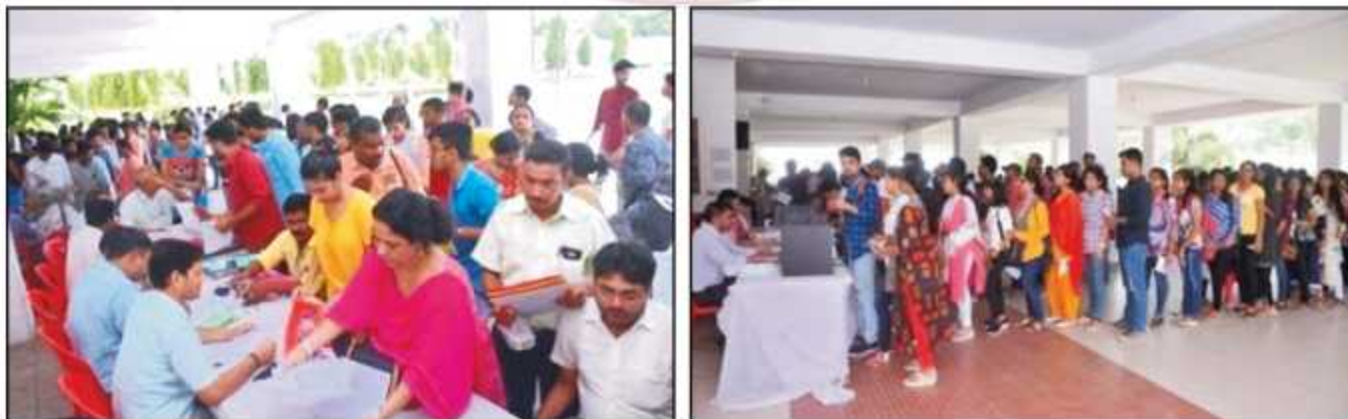
Centralized Admission System