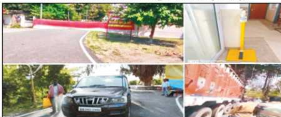
Barricading and vehicle sanitization at campus entry gate