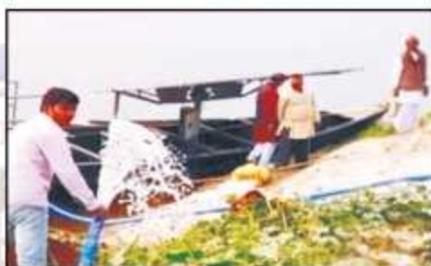
Inauguration of Water Management Building & Solar Powered irrigation at Pier village