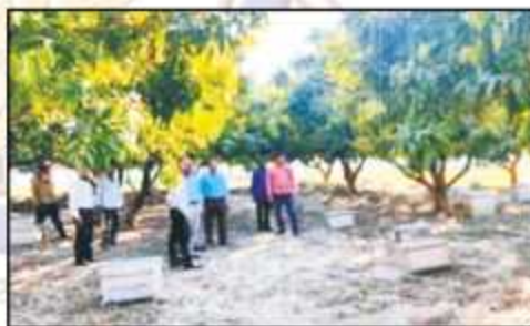
ELP on Beekeeping and Honey Production, TCA Dholi