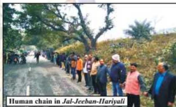
Human chain in Jal-Jeeban-Hariyali