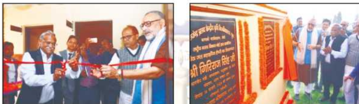
Inauguration of New Building of Library, RAS and Foundation stone for Establishment of Freshwater Prawn Hatchery at COF, Dholi