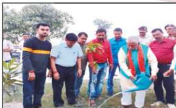
Hon'ble Agriculture Minister Shri Prem Kumarji, Govt. of Bihar, visited KVK Piprakothi (1 Nov 2019)