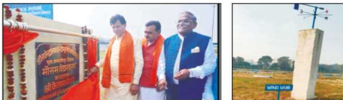
Meteorological Observatory established and inaugurated at RPCAU Pusa