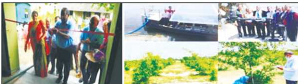
Bamboo processing centre & Irrigated bamboo plantation