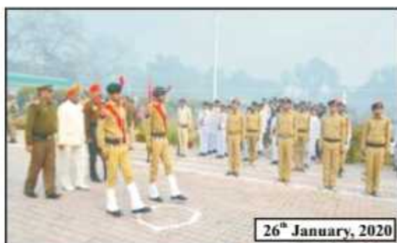
26 th January, 2020