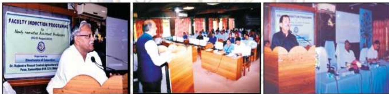
Activities of Faculty Induction Programme

The university has created conducive environment of academic and research work through development of State of the Art facilities and services like smart classes, digital library, well equipped laboratories, faculty up-gradation, capacity building and anti plagiarism mechanism to ensure quality education and research. A centralized hassle free, cashless, single window admission process has been introduced and an effective monitoring system for various academic activities right from admission to result declaration has been implemented. As part of HRD development faculties were allowed to attend 35 Seminars, 66 Conferences, 73 Workshops and 64 Trainings. A Faculty Induction Programme was also organized during 1 st to 21 st August, 2019 for newly appointed 51 Assistant Professors/Scientists.