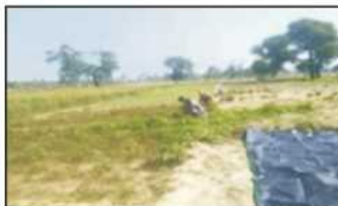
Butterfly garden, Permaculture in Dhab area for Sustainable Livelihood