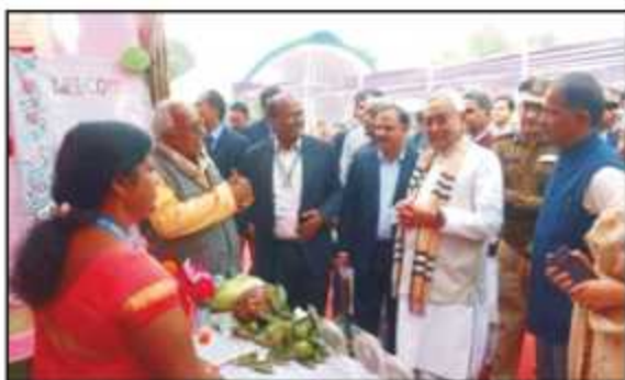
Hon'ble CM Nitish Kumar ji visited KVK Siwan, stall. (5 Dec 2019, Siwan)