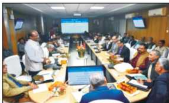
The QRT for ATARI, Zone-IV & V (Kolkata & Patna) visited RPCAU, KVKs for reviewing their activities & achievements of KVKs during 2011-19, from 10-13 December 2019