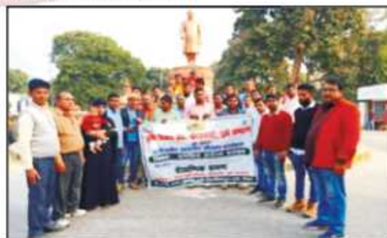
KVK Piprakothi organized an exposure visit at RPCAU, Pusa for trainees of 15 days INM training program. Trainees visited different demonstration units established at the university campus. (27 Nov 2019)